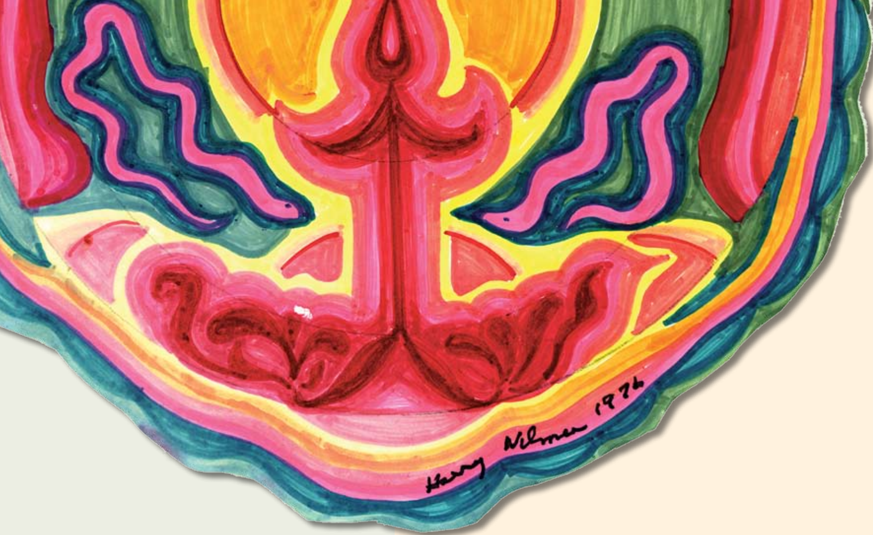
Cover Art: "The Nucleus of Creative Energy" by Harry Wilmer