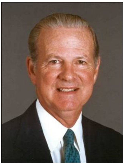
H. W. Brands, PhD

The Hon. James A. Baker, III has served in senior government positions for four United States Presidents. He served as the nation's 61st Secretary of State from 1989 through August 1992, under President George H.W. Bush. During his tenure in the State Department, Mr. Baker traveled to 90 foreign countries as the United States confronted the unprecedented challenges and opportunities of the post-Cold War era. He has written on those years of revolution, war and peace— The Politics of Diplomacy .